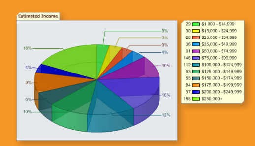
Conduct marketing analysis and segmentation in the easy-to-use analytics dashboard

Draw any shaped target on the map and get an immediate count of names.